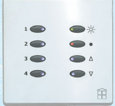
SCE-02-BSS-44 with SCE-02-02-BLK