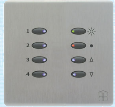
SCE-02-BSS-44 with SCE-02-02-BLK