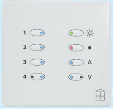
SCE-02-WHI-44 with SCE-02-02-WHI