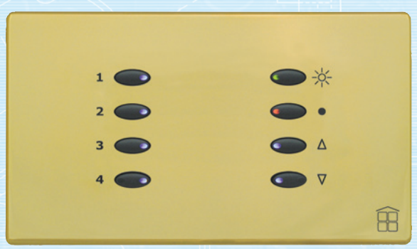
SCE-04-PBR-44 with SCE-02-04-BLA