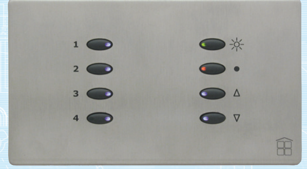
SCE-04-BSS-44 with SCE-02-04-BLA