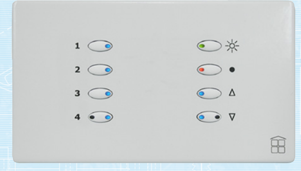
SCE-04-WHI-44 with SCE-02-04-WHI