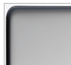
POC – Polished Chrome