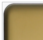
PBR – Polished Brass