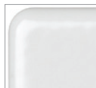
WHI – White