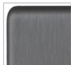
BNK – Brushed Nickel