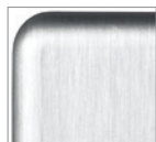
BSS – Brushed Stainless Steel