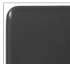
CHA – Charcol