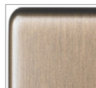
ABZ – Antique Bronze