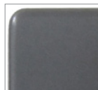
NKL – Polished Nickel