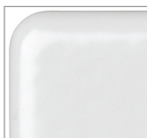
WHI – White