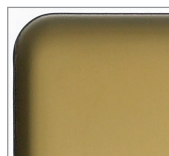
PBR – Polished Brass