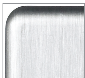
BSS – Brushed Stainless Steel