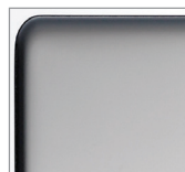
POC – Polished Chrome