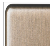
ABZ – Antique Bronze

Custom finishes and alternative plate styles available to special order